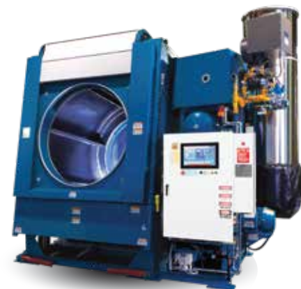
WHISPERDRYer Our Quietest Dryer Ever