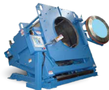
Open Pocket Washer/Extractor