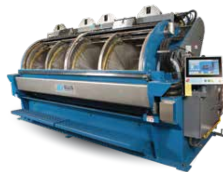
Side Loader Washer/Extractor