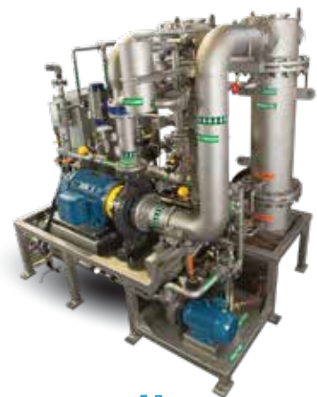
Nautilus 2.0 Ceramic Filtration System