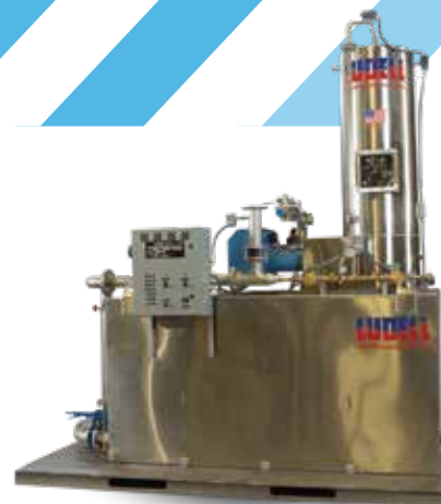
Ludell Water Heating & Heat Recovery Systems